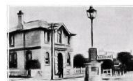
Levin Post-office 1903

Location: Te Takere Heritage Room 10 Bath Street Levin