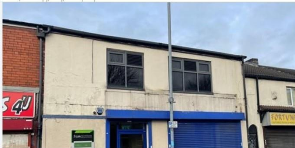
Pictured above: the chip shop Higher Parr St. Below: Kurz Works, United Alkali Company