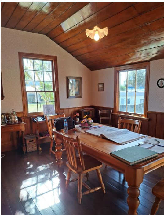
Nye Cottage interior.

Nye Cottage is an amazing restoration of a building built 150 years ago and is Manawatu's oldest. The detail is meticulous and gives a great feeling of life in the 1870's.