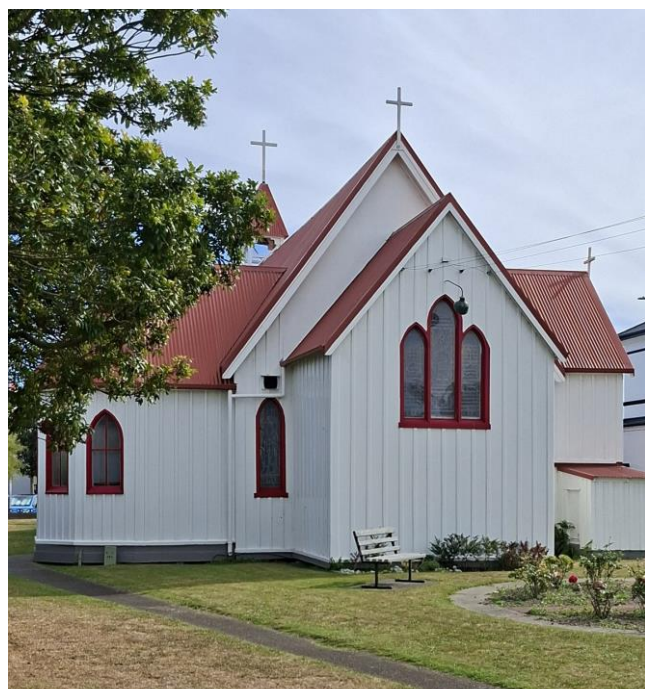
Anglican All Saints Church Foxton built in 1876.