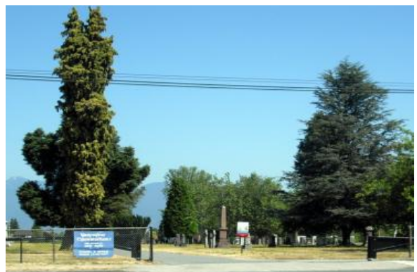
Above: entrance to Vancouver Cemetery.