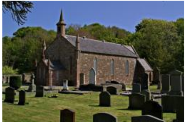
Above: The Old Layd Church and cemetery.

Ireland (Old Layd and nearby churchyards): Rodney researched into the older McCurdy line in County Antrim, including visits to historic burial grounds and searching for earlier headstones.